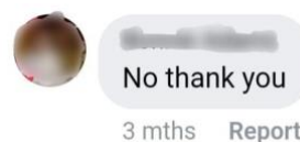
Figure 6. Negative Comment from Facebook

Source: H* T* S** A** account Post. Screenshot taken on November 26, 2022 at 3:32 p.m