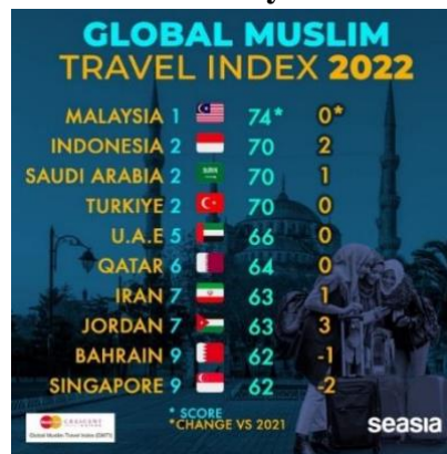
Figure 1. Most Friendly Destination 2022