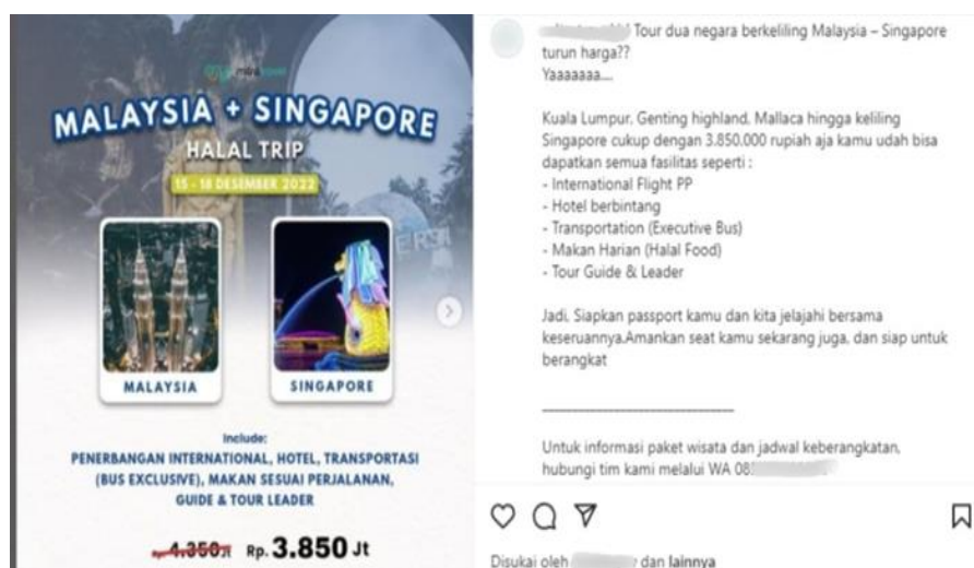
Figure 2. A Post relating to Halal Trip

One example of halal tourism was a post that we chose when we searched with hashtag "halaltrip" in an Instagram. Figure 2 shows a post that is taken from Instagram with hashtag #HalalTrip. There were 133 thousand posts appeared when this research was conducted. The post was made by an Indonesian agency tour and they have a halal tourist destination to Malaysia and Singapore with a price range of 3.8 million rupiah within 3 days as stated in the Figure 2. This post got 43 likes and 11 comments. And the post was posted on November 8, 2022.