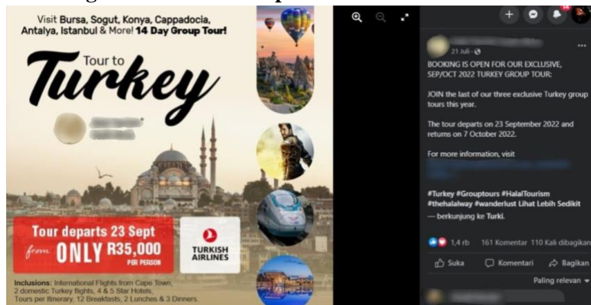
Figure 3. A Facebook post on Halal Tourism