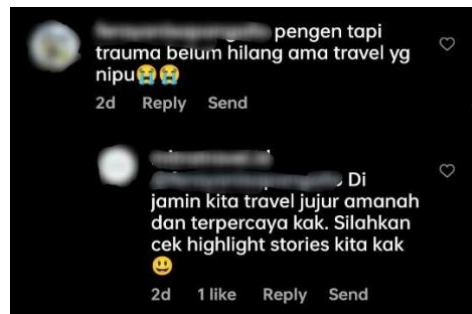
Figure 5. Doubtful Comments from Instagram

Source: M***** Account Post. Screenshot taken on November 26, 2022 at 3:24 p.m.